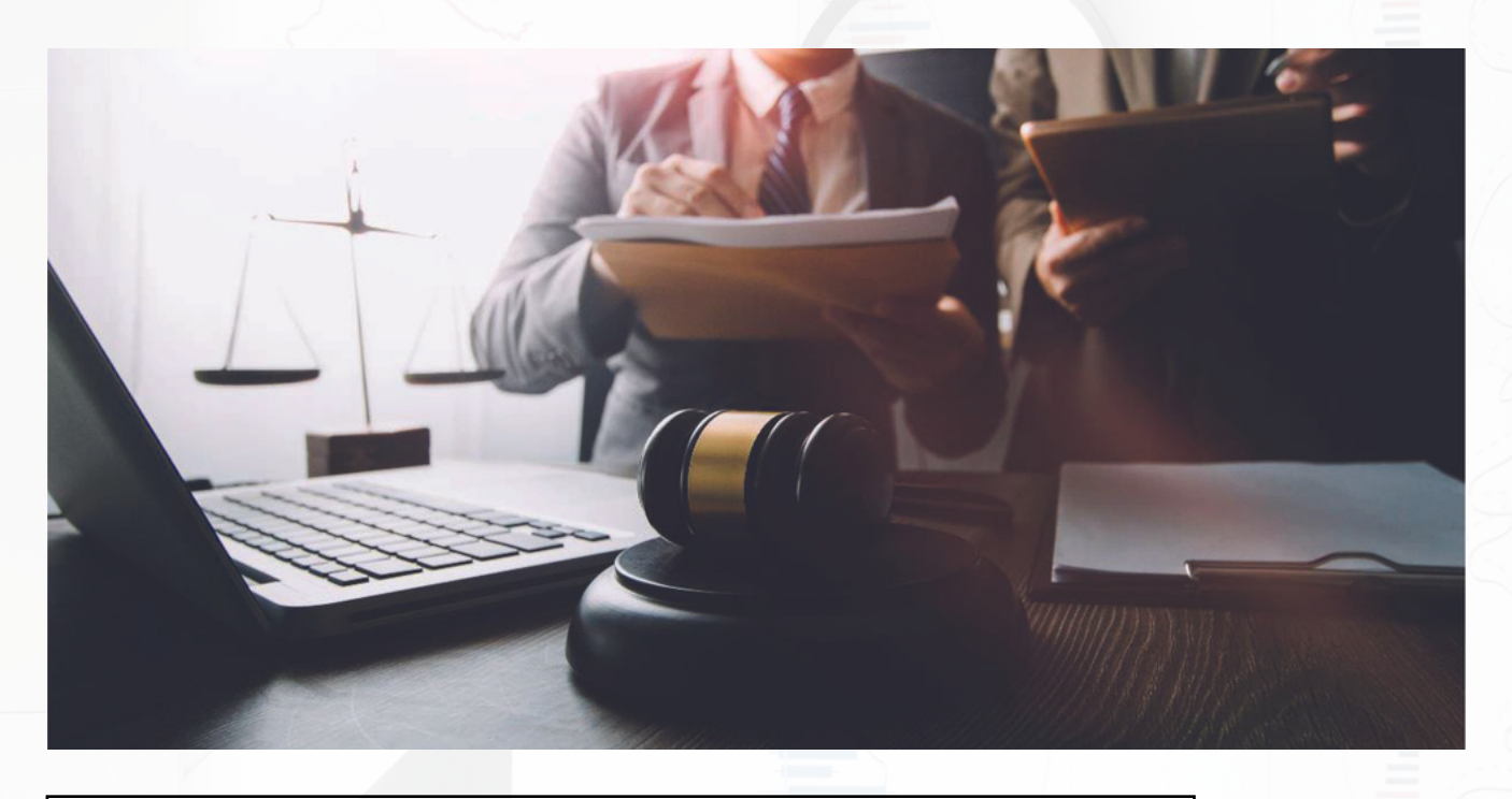
Full Judgement: CU Inspections & Certifications India Pvt. Ltd

• While accepting the Assessee's claim, the Tribunal applied the ruling of the jurisdictional high Court in the case of CU Inspections India (Assessee's Holding Company) on similar facts and held that since the license fees prescribed in the agreement was for the period of 12 months i.e., January to December, the Assessee rightly recognized 3 months income i.e., January to March as accrued in the year under consideration and offered it to tax and the remaining income of 9 months was shown as "income accrued but not due" in the liability side of balance sheet which was subsequently offered to tax in AY 2015-16.